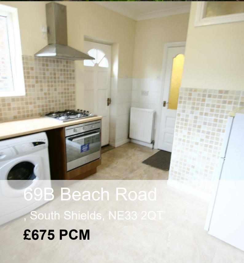
69B Beach Road , South Shields, NE33 2QT £675 PCM